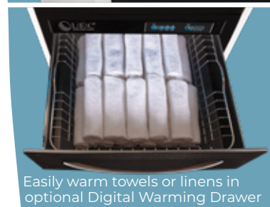
Easily warm towels or linens in optional Digital Warming Drawer