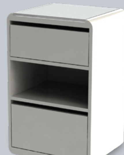
Convenient open storage shelf