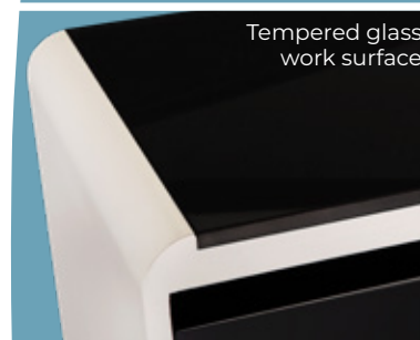
Tempered glass work surface

This elegant throwback trolley design is packed with practical features including a tempered glass work surface, soft close drawers, surge-protected power strip, and soft rolling casters. Add an optional Digital Warming Drawer to the standard Parker Trolley (or Mini Hot Towel Cabinet on Parker Mini) for hot towels or stones and you have a fully functioning workstation, available in bespoke finishes.