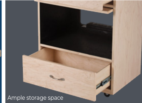
Ample storage space