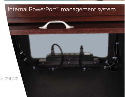
Internal PowerPort™ management system