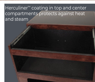
Herculiner™ coating in top and center compartments protects against heat and steam